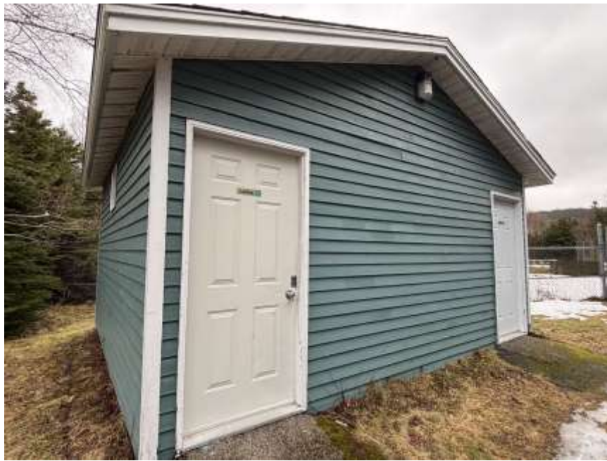
Existing Festival Grounds Washroom Building (Byrne's Road, Holyrood)