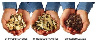
CHIPPED BRANCHES SHREDDED BRANCHES SHREDDED LEAVES

Getting started is easy! Recycle at the curbside in 3 simple steps: Sort it, Bag it, Curb it!