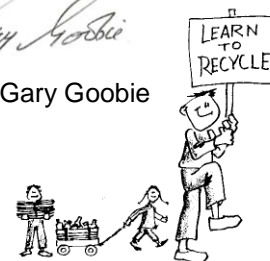
Mayor Gary Goobie